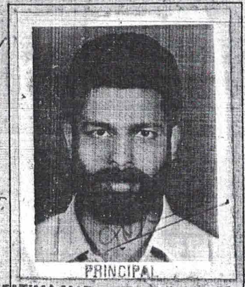
FATIMA MATA NATIONAL COLLEGE QUILON.

3. PERMANENT ADDRESS..... KUMARA BHAVAN MANGARAM KONNI. P.O. PATHANAMTHITTA DIST. PIN. - 689 691