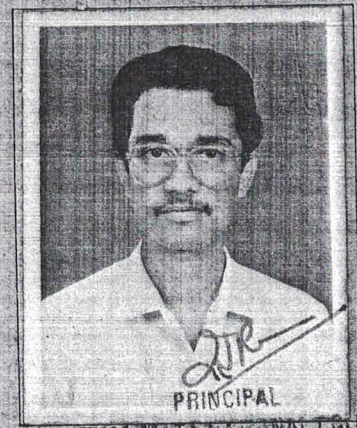
PRINCIPAL FATIMA MATA NATIONAL COLLEGE QUILON.

3. PERMANENT ADDRESS..... EPARAYIL KADAPPAKKADA QUILON