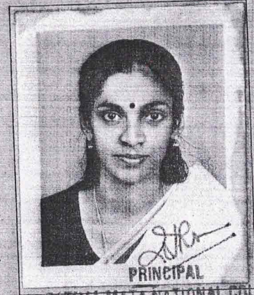
FATIMA MATA NATIONAL COLLEGE QUILON.

3. PERMANENT ADDRESS..... VELLACKKAL PAKALOMATTOM KURAVILANGAD. KOTTAYAM