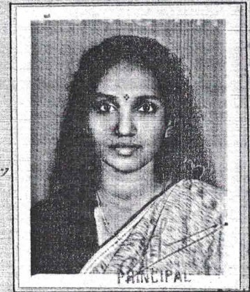
FATIMA MATA NATIONAL COLLEGE QUILON.

3. PERMANENT ADDRESS..... VALIEZHUTHU, PUTHUKADU, MUKUNDAPURAM.P.O., KOLLAM.