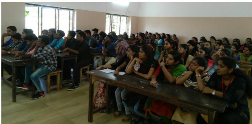
PHOTO EXHIBITION ON STOBILANTHES KUNTHIANUS AND ASSOCIATED SPECIES BY THE DEPARTMENT OF BOTANY