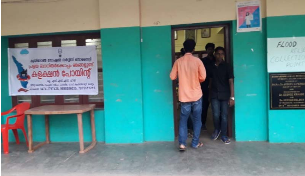
Fatima Community Outreach joins hands for flood relief activity organized by QSSS.