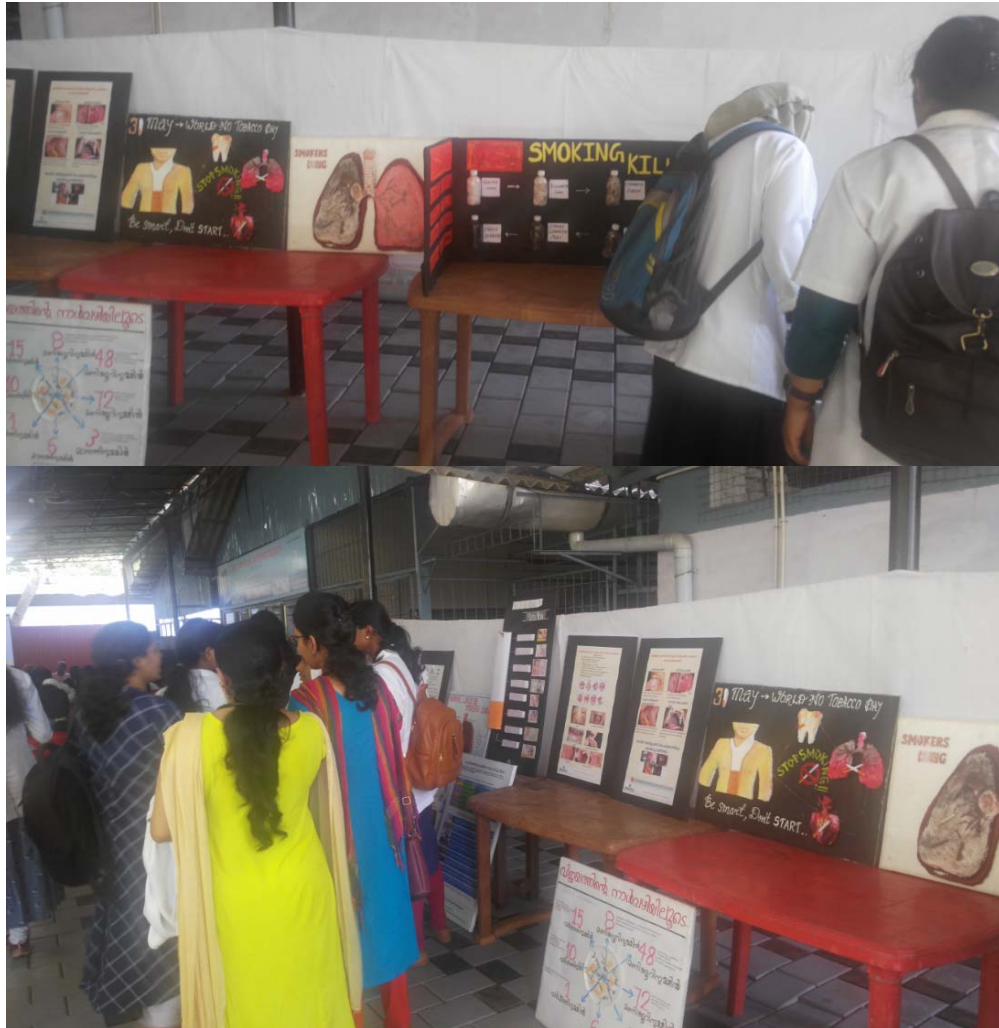
Students' participation and interaction with general public in the Cancer Screening Camp, Awareness Programme & Medical Camp jointly organized by QSSS and Azeezia Medical College, Kollam on 10 th October, 2019.