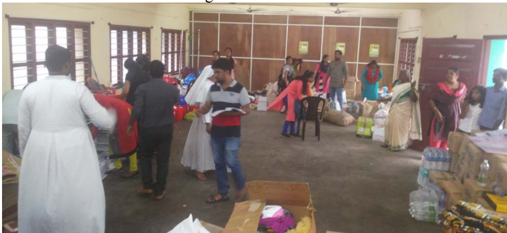
Students volunteered the Onam Kit preparation for the community ('Kaithangu Project by QSSS) during the Onam seasons.