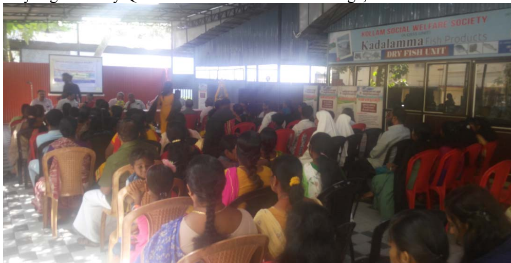
Students' participation and general public involvement in the Cancer Screening Camp, Awareness Programme & Medical Camp jointly organized by QSSS and Azeezia Medical College, Kollam on 10 th October, 2019.