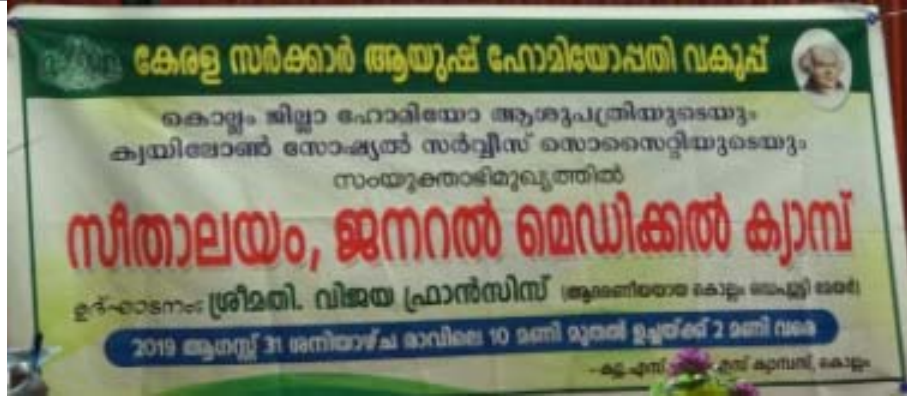
Students and faculty members involved in the ‘Seethalayam,’ General Medical Camp Organized by the Aayush Homeopathy Department, Government of Kerala and QSSS on 31 st August, 2019 from 10 am to 2 pm.