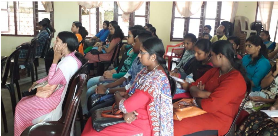
Students and faculty members involved in the participatory introduction session with QSSS