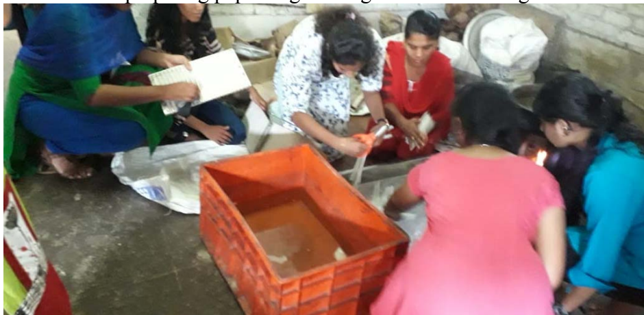
Students trained to make candle during hands on training session.