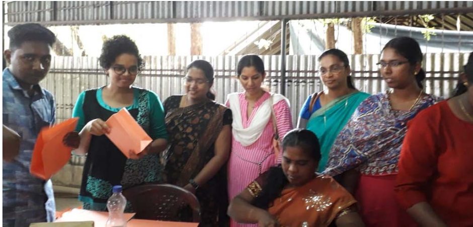
Faculty members and students actively involving in the hands on training session.