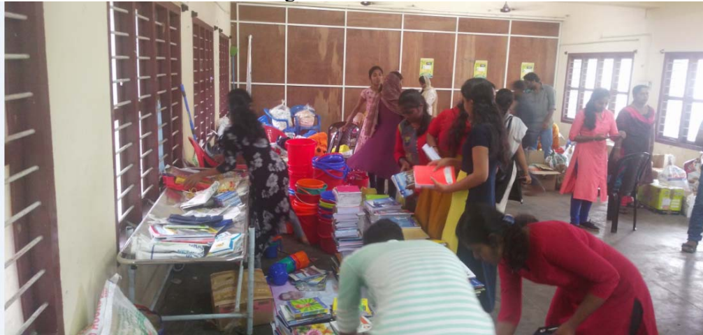
Students volunteered the Onam Kit preparation for the community ('Kaithangu Project by QSSS) during the Onam seasons.