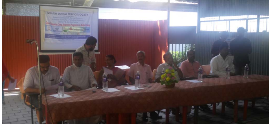
Participated and volunteered at the Cancer Screening Camp, Awareness Programme & Medical Camp jointly organized by QSSS and Azeezia Medical College, Kollam on 10 th October, 2019.