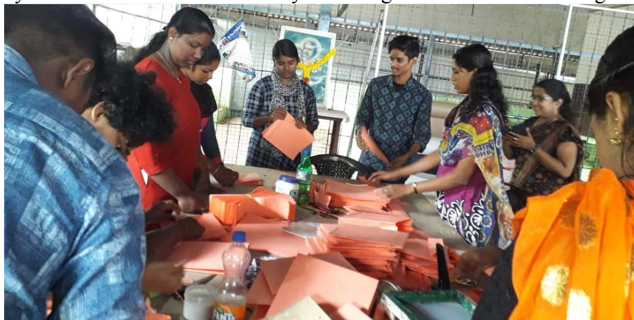
Students preparing paper bags during hands on training session.