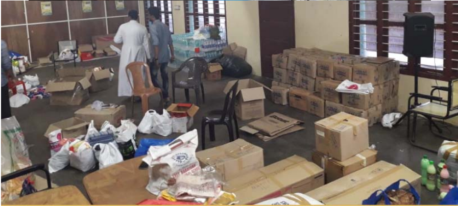
The flood relief materialspacked by the students