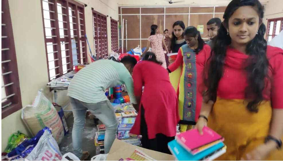
Students volunteered the Onam Kit preparation for the community ('Kaithangu Project by QSSS) during the Onam seasons.