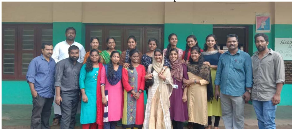
Students and faculty members involved in the Homeo General Medical Camp.