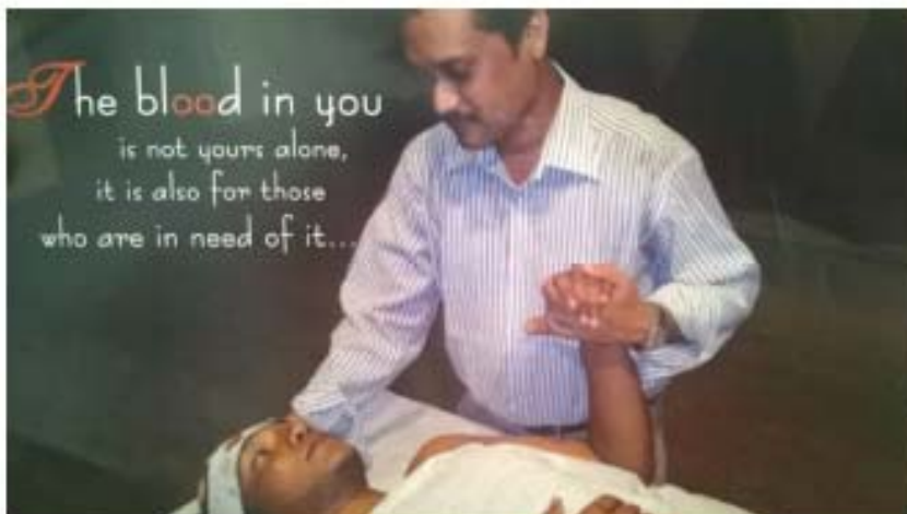
Best photograph award was given to this photograph of our NSS Unit by District Health Department during the blood donor day.