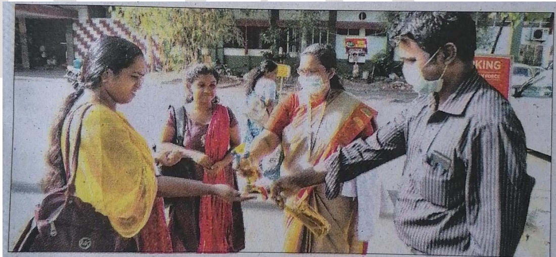
ഫാത്തിമ മാതാ നാഷണൽ കോളേജിലെ അദ്ധ്യാപകർ നിർമ്മിച്ച സാനിറ്റൈസറുമായി കൊല്ലം റെയിൽവേ സ്റ്റേഷൻ മുന്നിൽ യാത്രക്കാരുടെ കൈകൾ വൃത്തിയാക്കുകയും ബോധവൽക്കരണം നടത്തുകയും ചെയ്യുന്നു