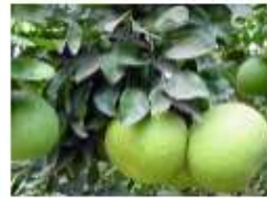
View Citrus maxima