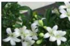
View Murraya paniculata