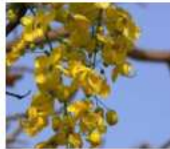
View cassia fistula