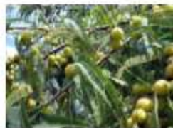
View Phyllanthus emblica L.