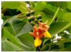
View Gmelina arborea