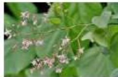
View Kleinhovia hospita L.