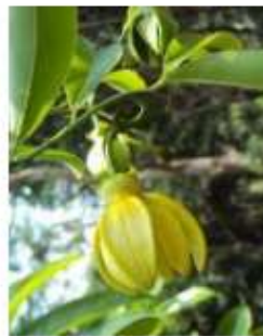
View Artabotrys odoratissimus