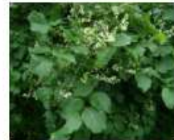
View Dalbergia latifolia Roxb.