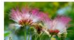
View Albizia saman