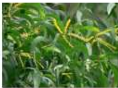
View Acacia mangium Willd.

The plants in the Campus are provided QR Codes, which will be labelled on the plants concerned. The database is maintained at the F.A.L.S.K. Digital Garden Project page. The database is self-explanatory, which includes the botanical details of the plants, photographs, points of interest both for a student of Botany and a layman. The page incorporates QR a to detailed information on the plant.