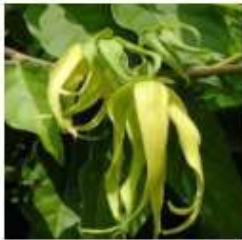
View Cananga odorata