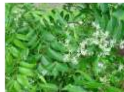
View Azadirachta indica