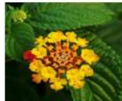
View Lantana camara