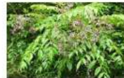
View Melia azadirach