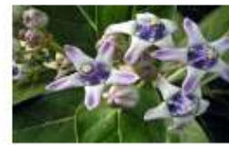
View Calotropis gigantea