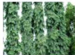
View Polyalthia longifolia