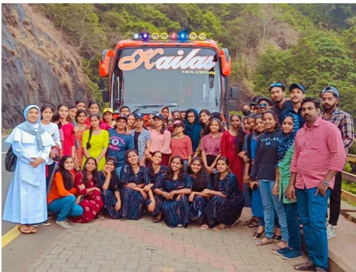
Fig 2: Tour Team members (BSc Botany 2019-2022)