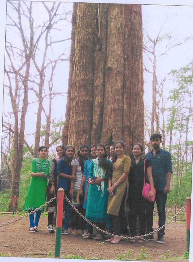
Figure 12: Kannimara Teak