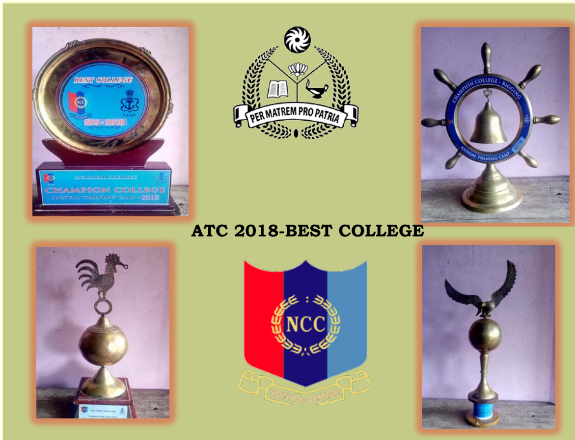
ATC 2018-BEST COLLEGE