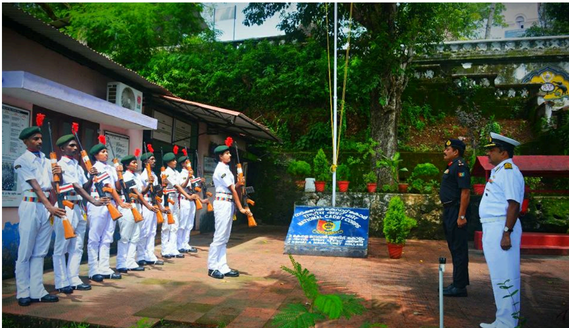
A Ceremonial Guard of Honour