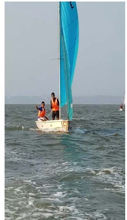
Naval NCC Waterborne Activities