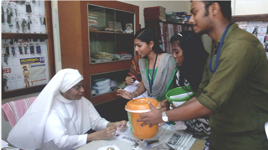
ARMED FORCES FLAG DAY FUND COLLECTION by Naval NCC Cadets