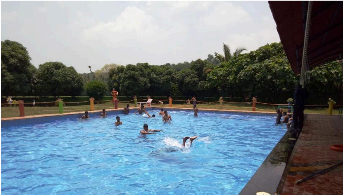
Swimming Practice for Cadets