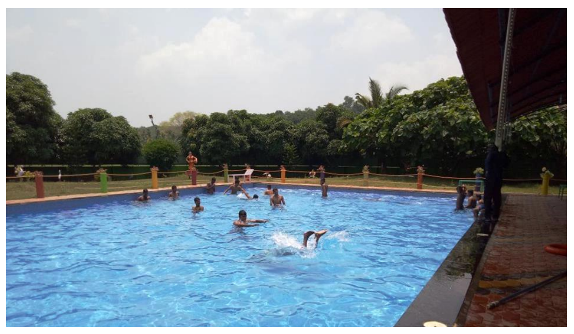
Swimming Practice for Cadets