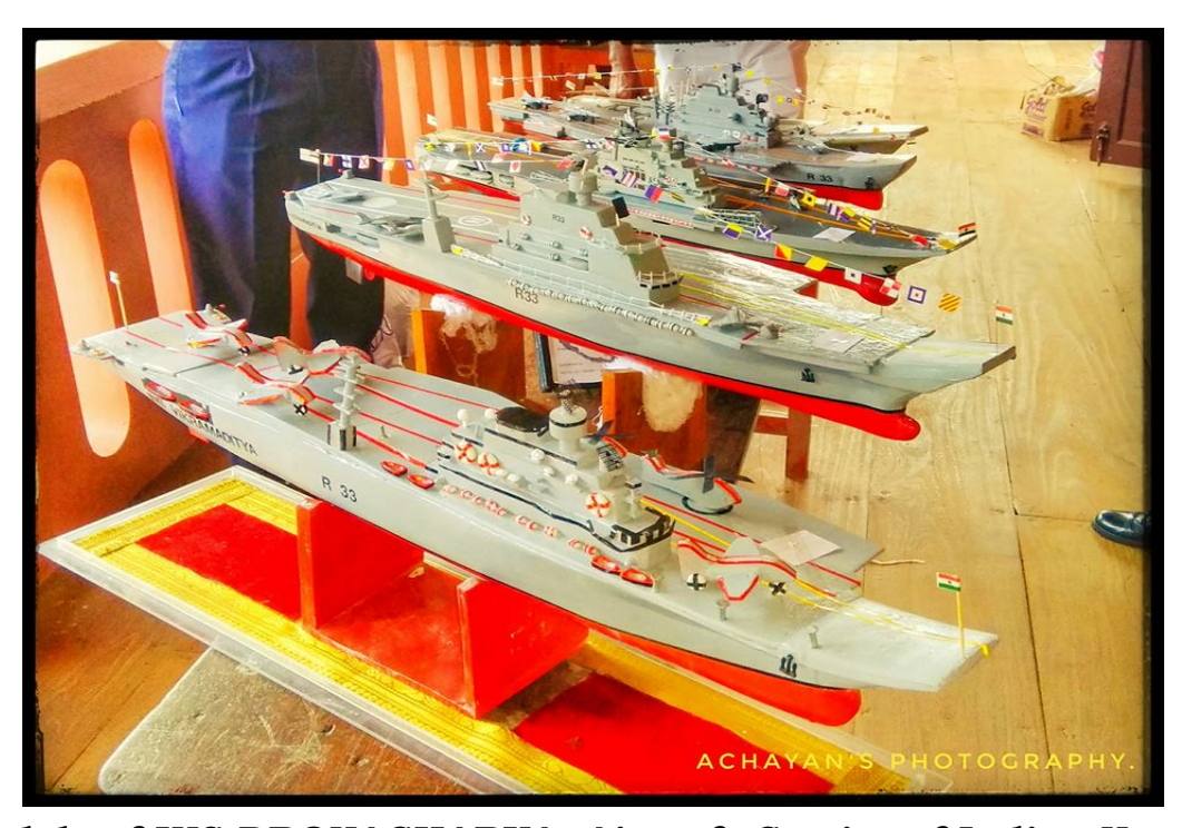
The models of INS DRONACHARYA, Aircraft Carrier of Indian Navy made by cadets