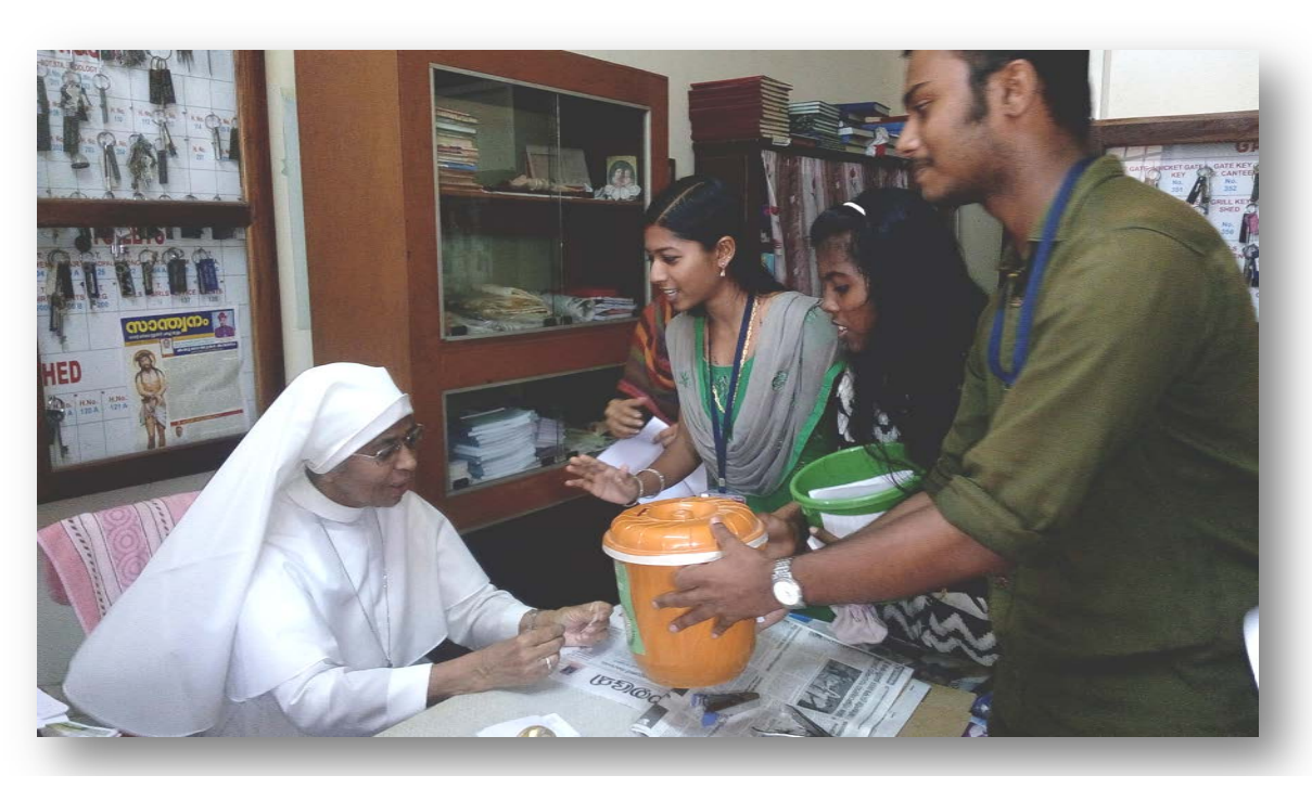
ARMED FORCES FLAG DAY FUND COLLECTION by Naval NCC Cadets