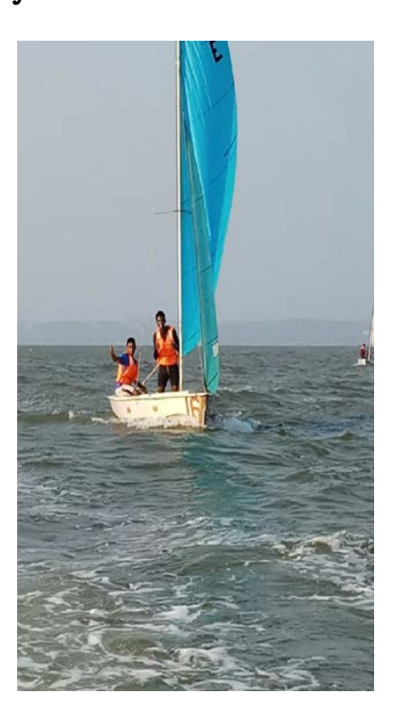
Naval NCC Waterborne Activities