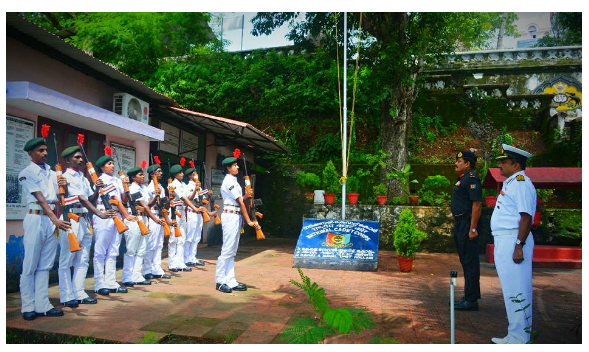
A Ceremonial Guard of Honour