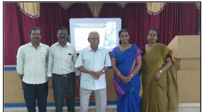
Seminar on “Academic Audit” : 11 th May 2018