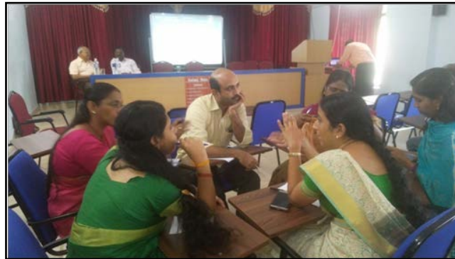
Workshop on “Question Bank Setting” : 21st march 2018