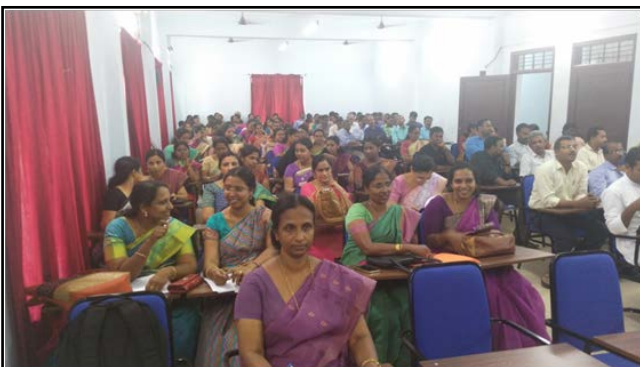
Workshop on “Benchmarks in Revised Accreditation process”- 9th March 2018