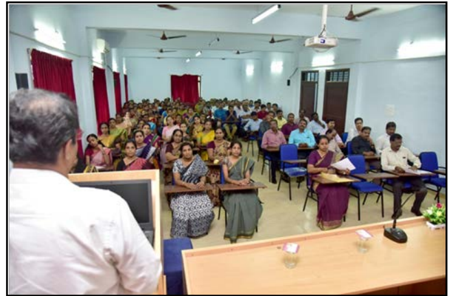
Seminar on “Quality Enhancement & Sustenance in Higher Education: The Emerging Trends“- 20th November 2017