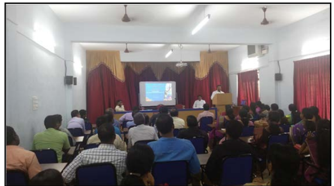
Seminar on “Relevance of Self-Audit in Autonomy” - 6th February 2018