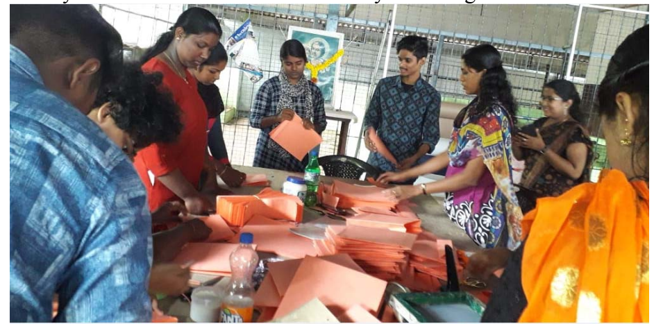
Students are preparing paper bags during hands on training session.