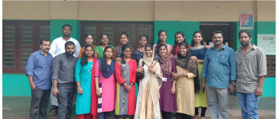
Students and faculty members who involved in the Homeo General Medical Camp.

Students and faculty members involved in the 'Seethalayam' General Medical Camp Organized by the Aayush Homeopathy Department, Government of Kerala and QSSS on 31<sup>st</sup> August, 2019 from 10 am to 2 pm.