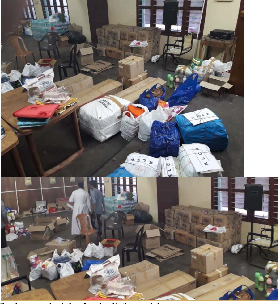
Students packed the flood relief materials.

Fatima Community Outreach joint hands for flood relief activity organized by QSSS.