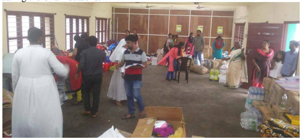
Students volunteered the Onam Kit preparation for the community ('Kaithangu Project by QSSS) during the Onam seasons.