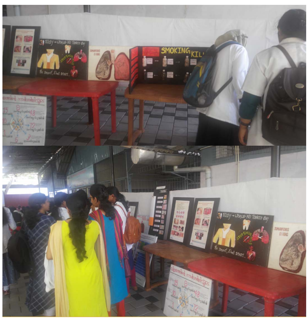
Students participation and interaction with general public in the Cancer Screening Camp, Awareness Programme & Medical Camp jointed organized by QSSS and Azeezia Medical College, Kollam on 10<sup>th</sup> October, 2019.