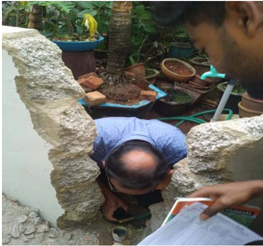
At a construction site