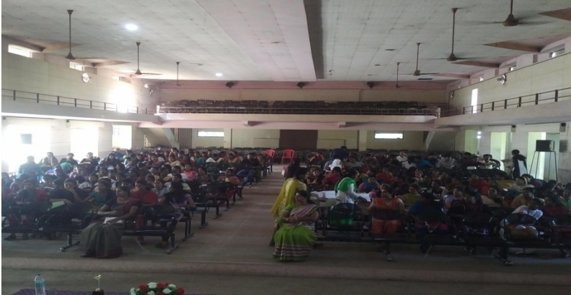
Interaction of staff and students