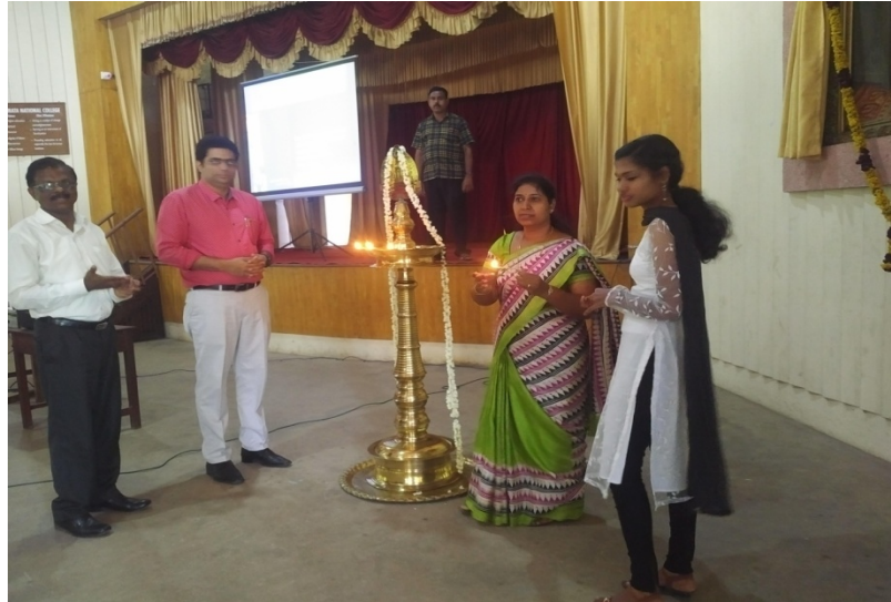
Presidential Address by the Principal