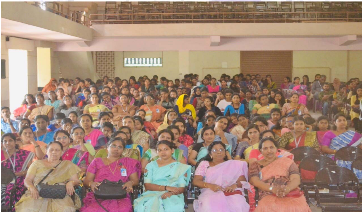
Environment Club – Bhoomitrasena – HARITHAM - GREEN AUDIT WORKSHOP