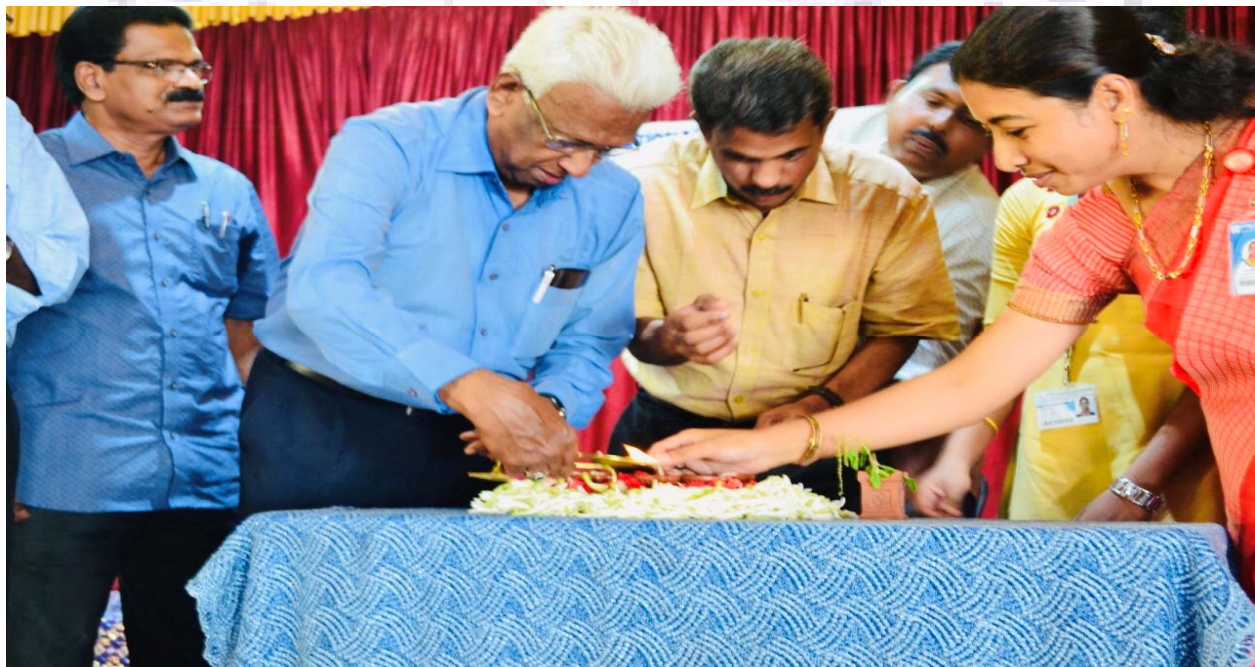
Environment Club – Bhoomitrasena – HARITHAM - GREEN AUDIT WORKSHOP